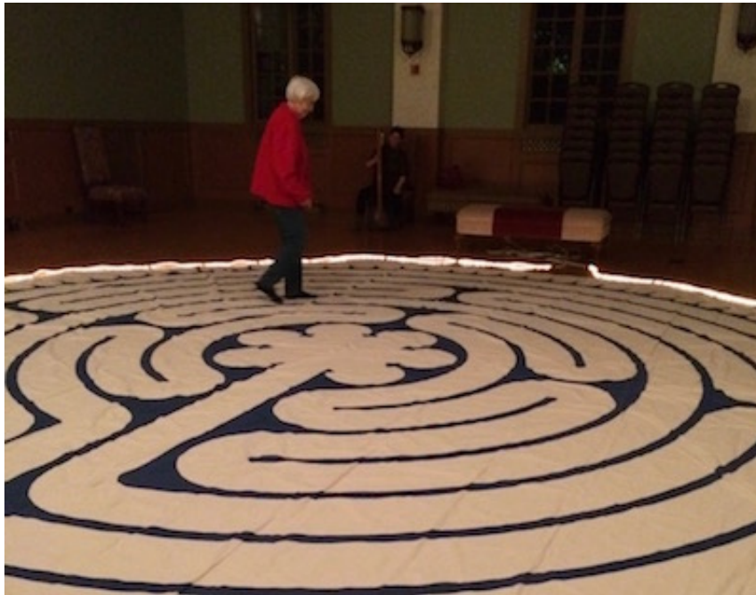
Heart and Soul Labyrinth Walk Marylhurst University - February 2016

Help Create a New Labyrinth at Marylhurst University