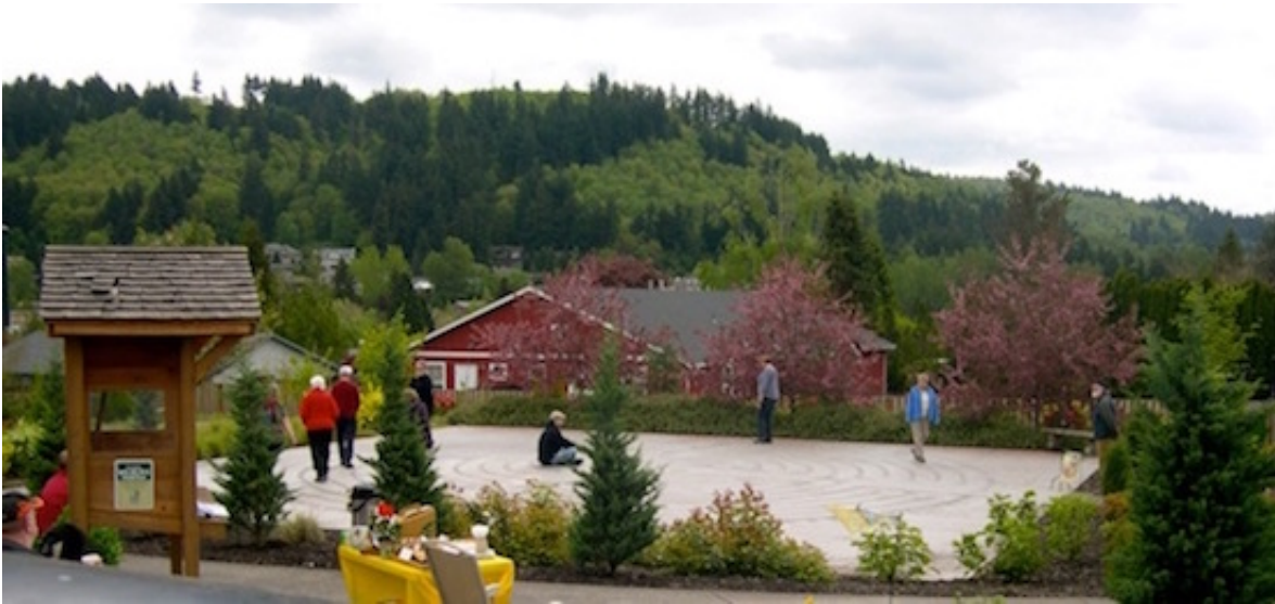
World Labyrinth Day 2012 - St. Luke's Episcopal Church, Gresham